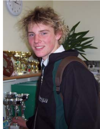
Prize for the Best Performance at GCSE by a dyslexic student:

Our A-level dyslexic cohort was small, with only 6 students, but they achieved a 100% pass rate and, like our GCSE students, they are now all at university studying the courses, or working in the jobs, that they chose to do.